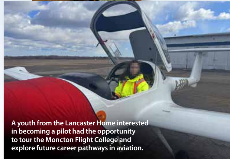
A youth from the Lancaster Home interested in becoming a pilot had the opportunity to tour the Moncton Flight College and explore future career pathways in aviation.