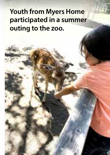
Youth from Myers Home participated in a summer outing to the zoo.