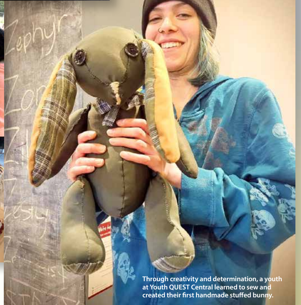
Through creativity and determination, a youth at Youth QUEST Central learned to sew and created their first handmade stuffed bunny.