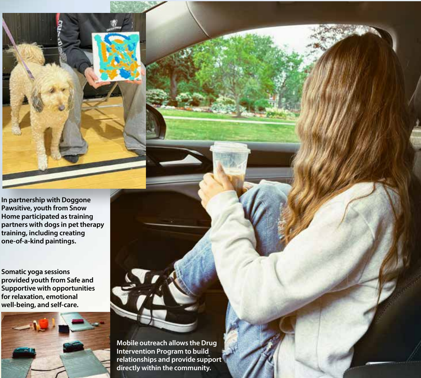
In partnership with Doggone Pawsitive, youth from Snow Home participated as training partners with dogs in pet therapy training, including creating one-of-a-kind paintings.