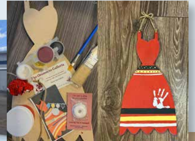
Youth from the Transitional Housing Program took part in a meaningful Red Dress Day activity focused on awareness, reflection, and learning.