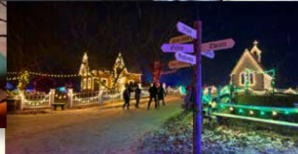
A holiday outing to Village Aglow at Kings Landing gave youth from Priestman Home the opportunity to enjoy seasonal activities and community connection.