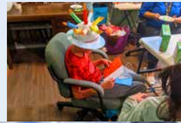
Celebrating birthdays helps create positive memories, connection, and a sense of belonging for youth at Myers Home.