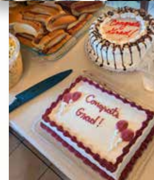
Fulton Home celebrated a youth's Grade 8 graduation and academic success, recognizing an important milestone and achievement.