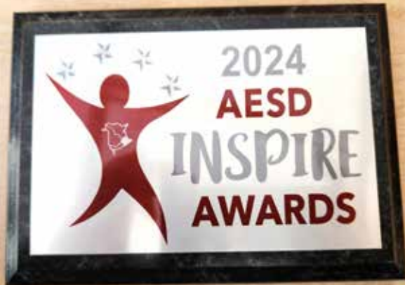
A youth from 52 Myers Home proudly received a District Education Council INSPIRE Award in May 2024, recognizing perseverance and resilience during his Grade 8 year.