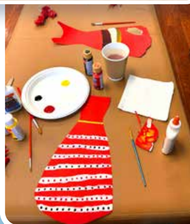
A youth from Fulton Home took part in an educational session on Indigenous culture for Red Dress Day.