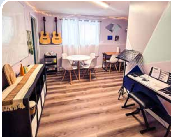
Priestman Home's new renovated Art Room.