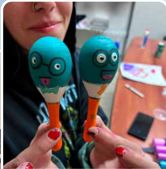
Youth expression through Youth QUEST Central's BraveArt Program.