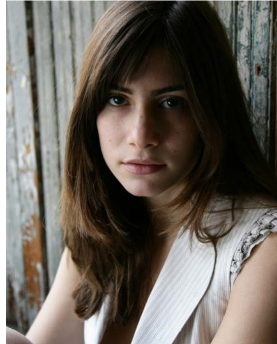
* Name and photo have been changed

When I was living at home, I was in an accident and had a metal rod placed in my leg. This was difficult for me because my coping skills had always revolved around physical activities, such as running and hiking. After the eviction, I started missing school and was connected with the Corridors worker at Moncton High School through whom I learned about the Transitional Housing Program.