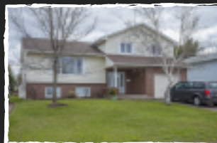
Fulton Crescent Residential Program Manager: Richelle Smith

The Centre provided assessment for 13 youth from throughout the province: 9 males and 4 females. Seven youth were anglophone and 6 youth were francophone. All 13 youth were admitted for treatment (12-18 weeks); 8 youth also had a multidisciplinary assessment conducted during their stay.